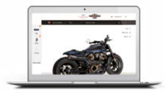
for more details check www.custom-chrome-europe.com

Dr. Jekill & Mr. Hyde | The Exhaust is a completely legal exhaust system that complies with European laws and is ECE, EG-BE and TÜV approved. The reason for this is that every Dr. Jekill & Mr. Hyde system contains a smartbox: this electronic control unit is the brain of the product and contains software that reads CANBUS signals coming from the motorcycle's ECU. By committing the system to the parameters set by EU legislation, the Smartbox will seamlessly and subtly intervene if necessary. Riders don't have to worry about breaking the law in any situation; the system is always legal no matter what sound mode is selected. Dr. Jekill & Mr. Hyde exhaust systems are fully compliant with the latest EURO norm. Before a system is released, it gets thoroughly tested by the proper authorities and only when they approve it, a Dr. Jekill & Mr. Hyde exhaust system becomes available for your bike.