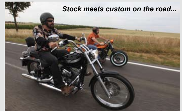
Stock meets custom on the road...

Harley-Factory @ the Web: www.Harley-Davidson-Frankfurt.de