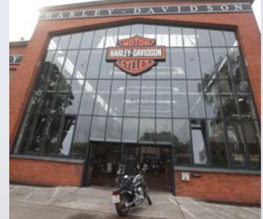
Entrance to the Harley-Factory