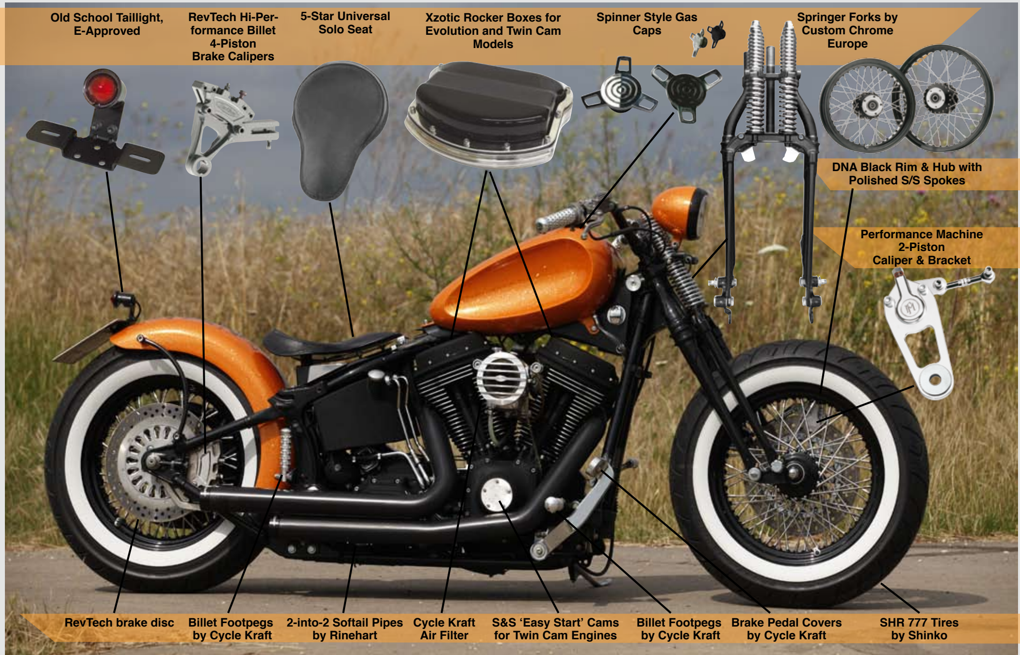
Sexy Thing: A selection of components used in the construction.