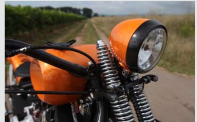
TOP: Cycle Kraft Airfilter and Xzotic „Panhead-style heads convert the modern Twin Cam; BOTTOM: CCE headlight, bullet indicators and Springer fork.

sales rep for Spain, had to be flown in from Spain (2015 Oscar-nominated for funniest performance on a custombike!) and “female star” Veronica Calilli was hi-jacked from a summer job in Egypt!