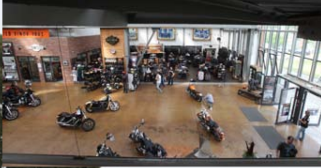
View on the showroom of Harley-Factory