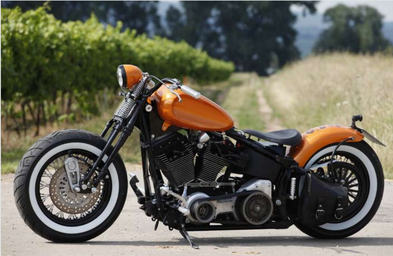
TOP: „Sexy Thing“ with its distinctive low silhouette, thanks to the CCE Lowering kit and Springer fork. Spoke wheels and white wall tires add to the „Old School“ look. The „Lucky F*cker“ conversion kit fits all Twin Cam Softails and is available in carburetor and fuel injected versions.

B base that has been produced by Harley-Davidson for more than a decade now. Since the 2010 introduction of the original “Lucky F*ucker” kit, styles have shifted somewhat, so have little details in HD production that needed to be adapted for the proposed easy assembly of what is basically a “bolt on” customizing job. The “Bobber style” has become somewhat more popular, as Harley-Davidson recognized themselves with the introduction of the “Forty Eight”. And it should be mentioned that even the updated “Lucky F*ucker” conversion kit does only include tank (multiple options!), tank adapter (for clean look