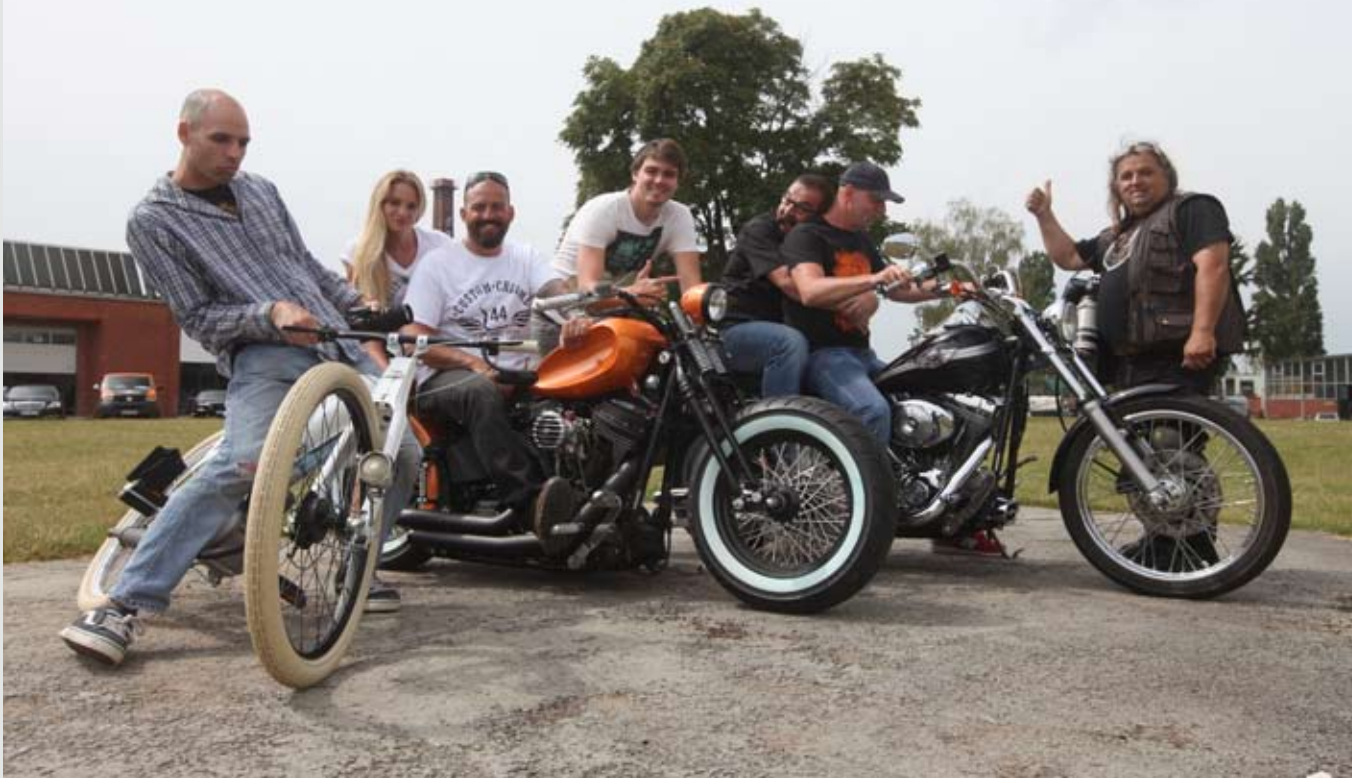
The filming team celebrating the end of the second filming day in front of the Harley-Factory Frankfurt.