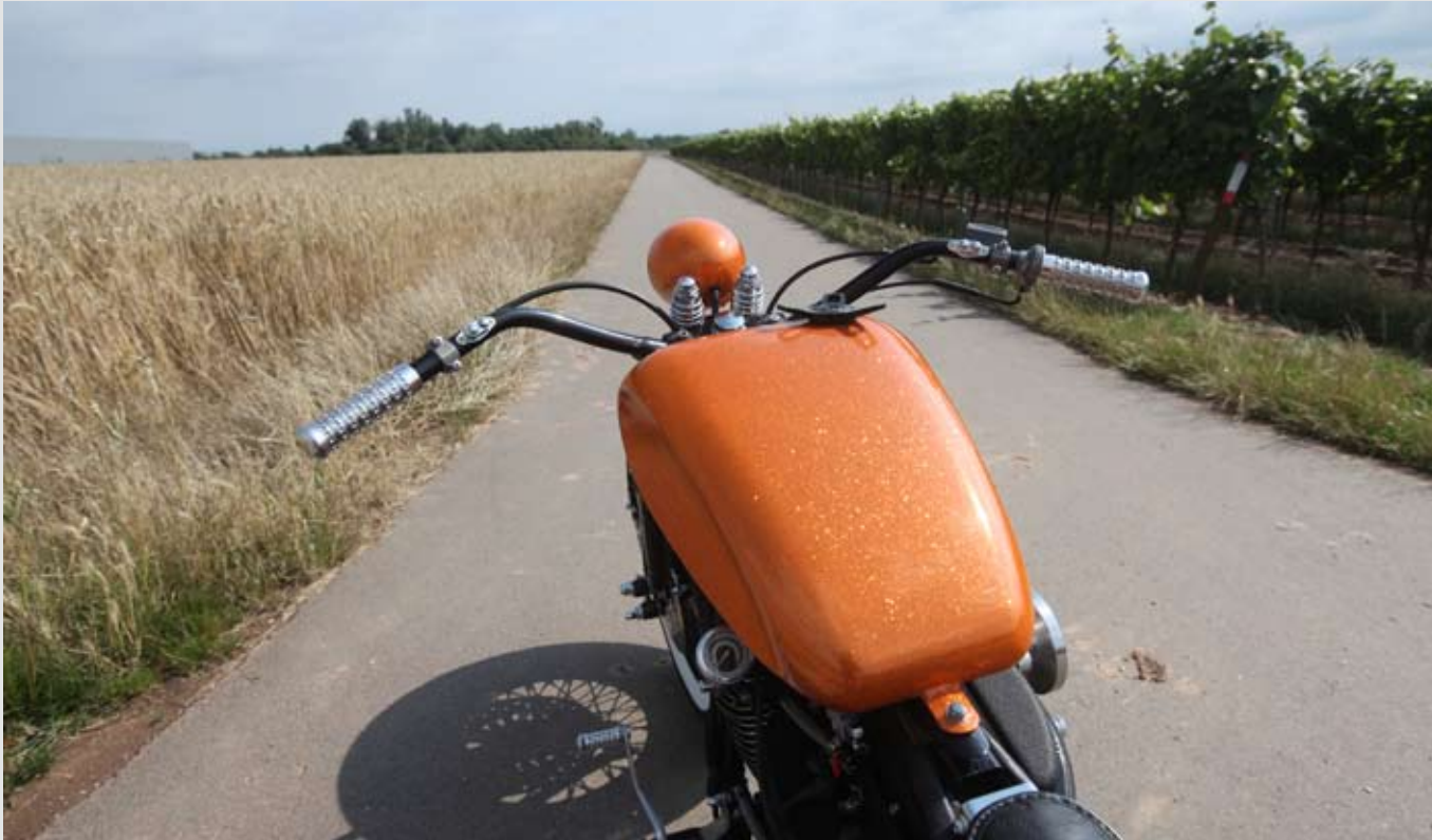
A combination of CCE distributed „Old School“ and „New School“ parts from Italy and Japan add up in this Bobber style Softtail conversion: Cycle Kraft, air filter, grips and pegs work with Cycle Kraft controls and the Jammer „Speedster“ handlebar. Not to forget the „Lucky F*cker“ kit.