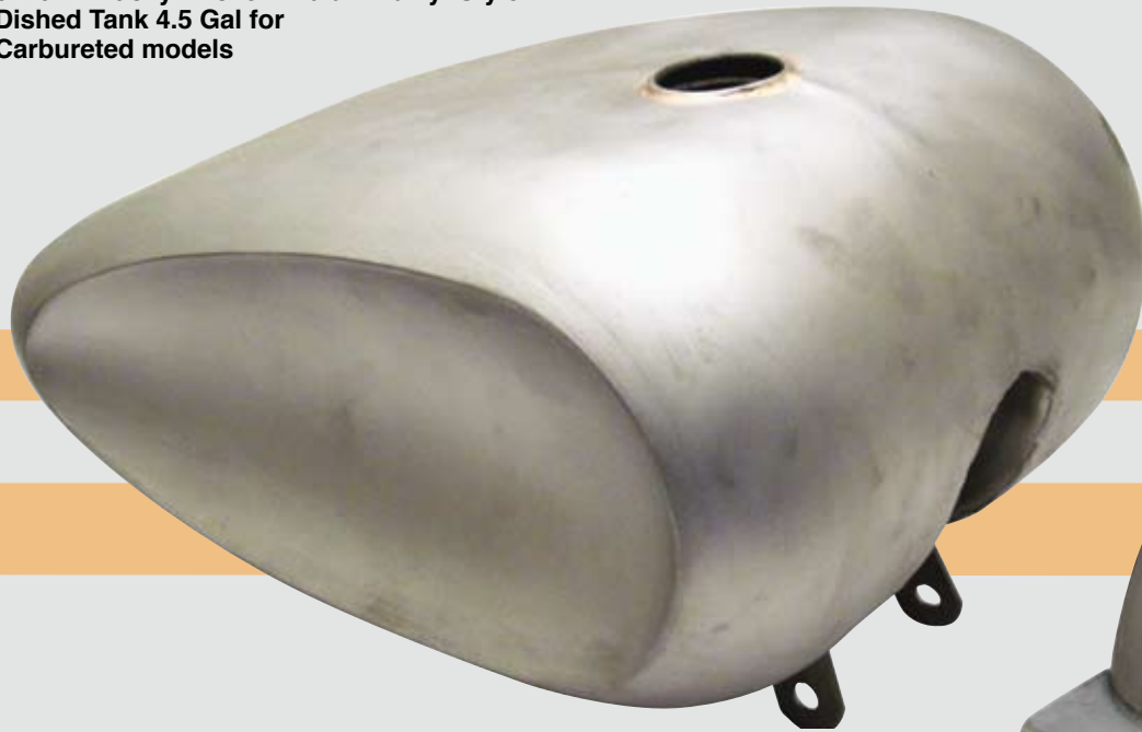
641914 Lucky F*cker Indian Larry Style Dished Tank 4.5 Gal for Carbureted models