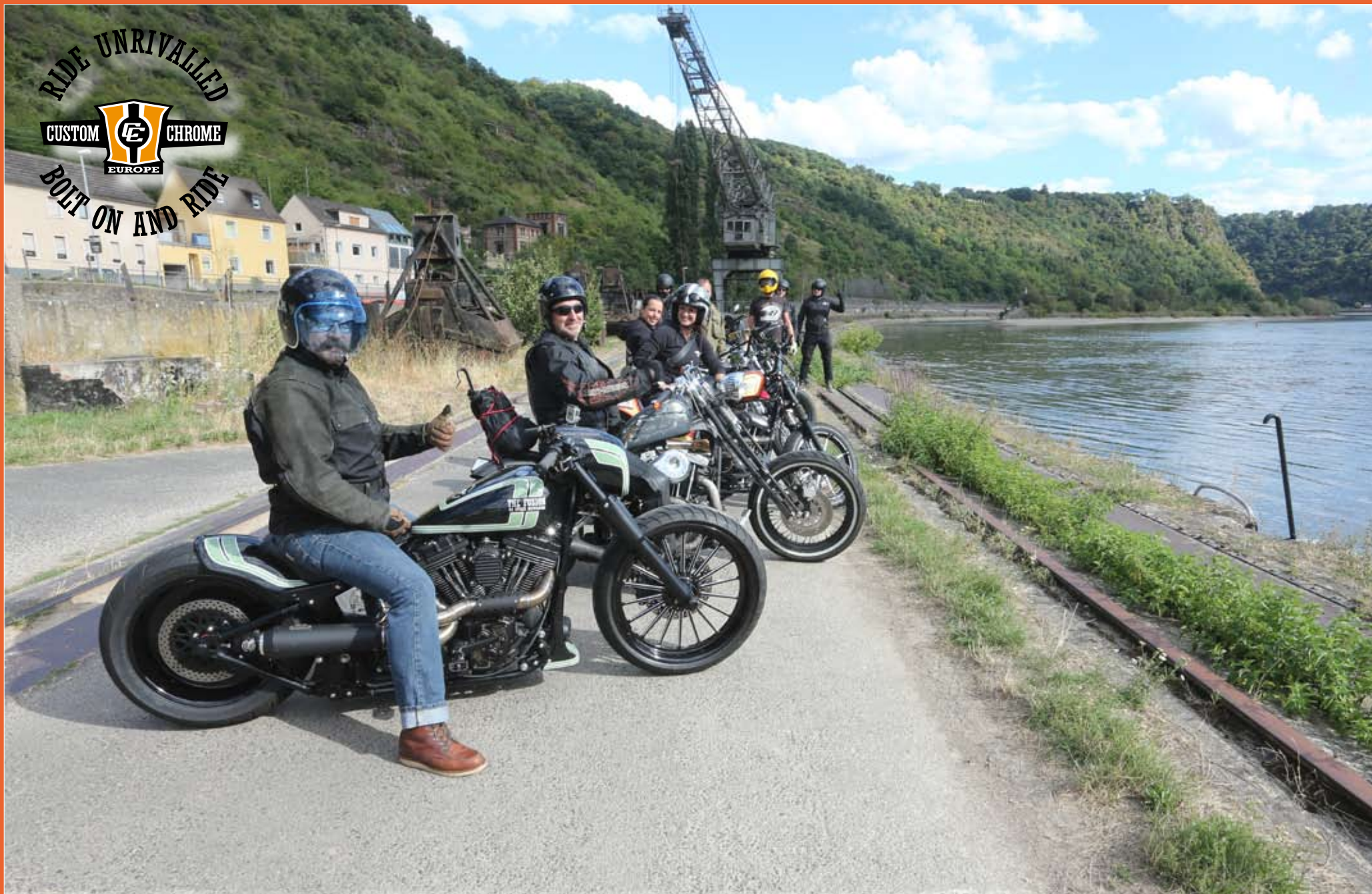
Stop at the Loreley rock: The 2018 CCE Staff tour to Bonn passed some of the most scenic locations of Rhine valley and Eifel mountains.