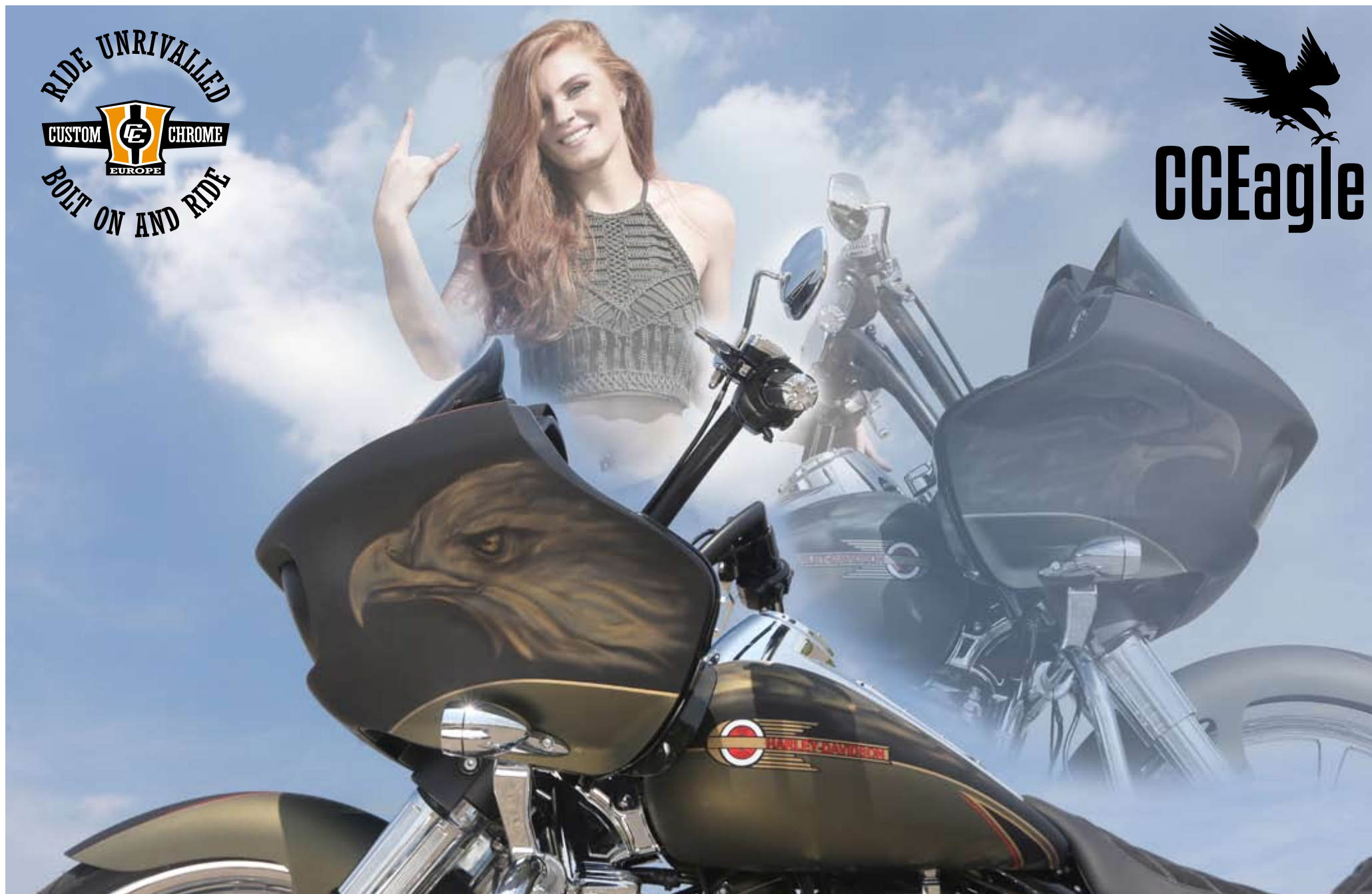
The "Eagle" airbrush design becomes almost alive in the sunshine.