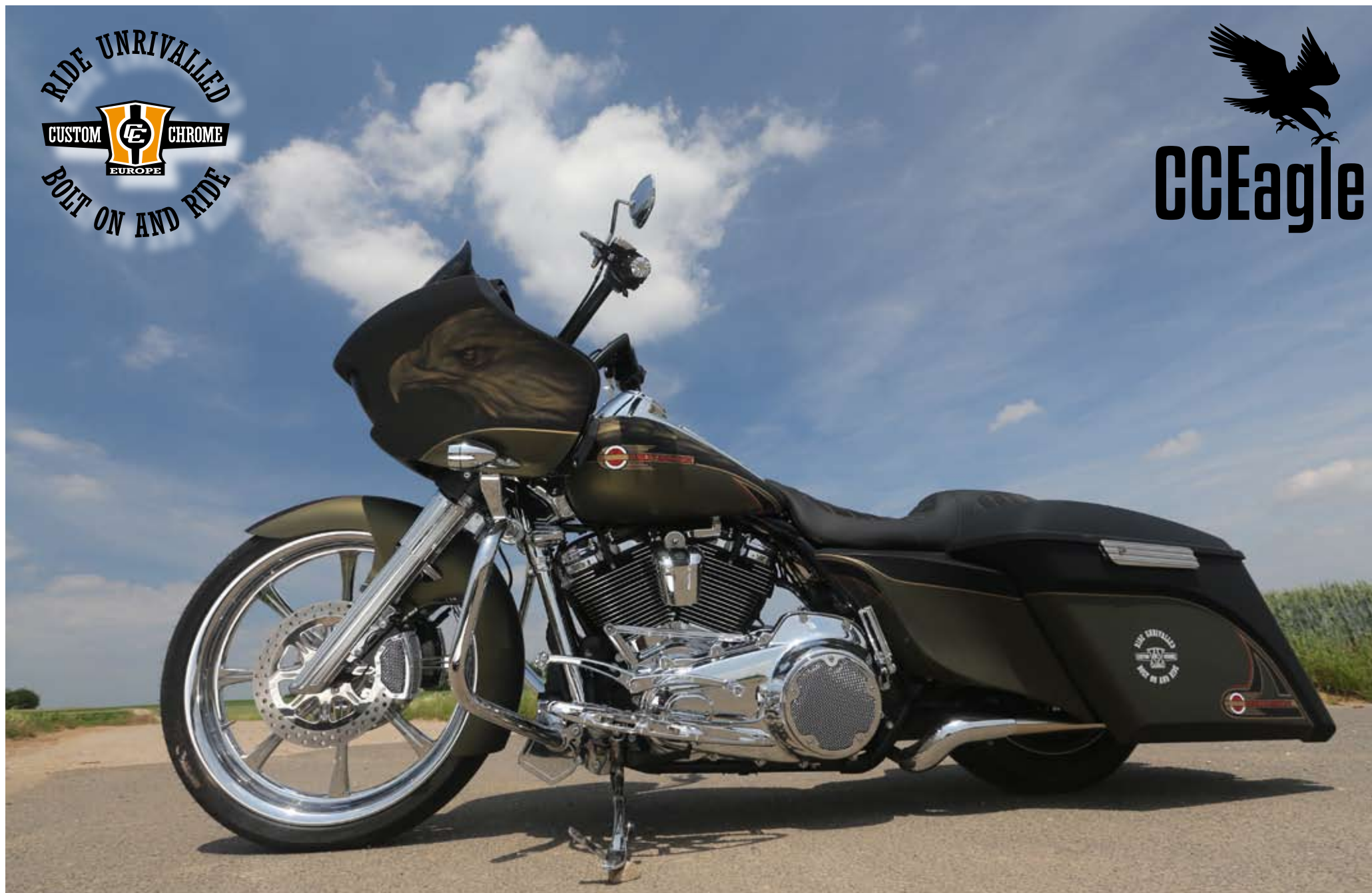
The rolling chassis remains pretty much in stock setup, but the stock wheels were exchanged for a complete set of RevTech "Meridian" design wheels.