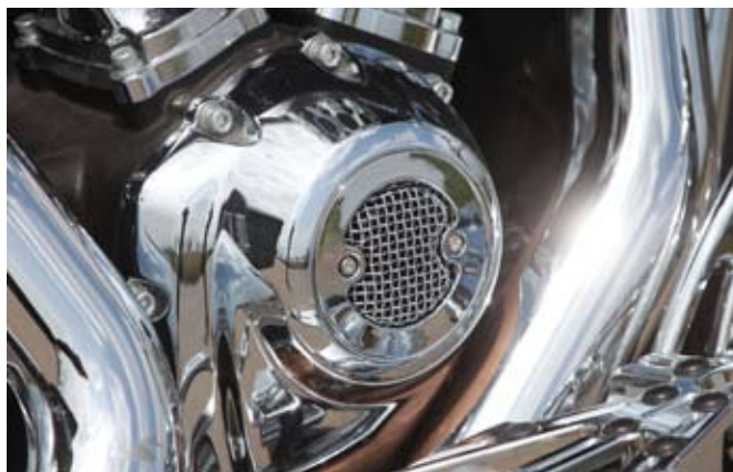
DETAILS: Kuryakyn Mesh covers grace motor and primary and Thunderbike air filter.

prise. Some design lines feature dozens of often very different components, all of which have to be checked for fitment and possibly re-designed – and produced! Not to mention that Kuryakyn not just adapted current established design lines to the new engine and rolling chassis – they developed new an innovative idea. If you check out the touring frame of the CCEagle“, you may notice the chromed downtubes and steering head, a customizing zone often neglected by the builders. Chromed frame? Despite the incredible effort to