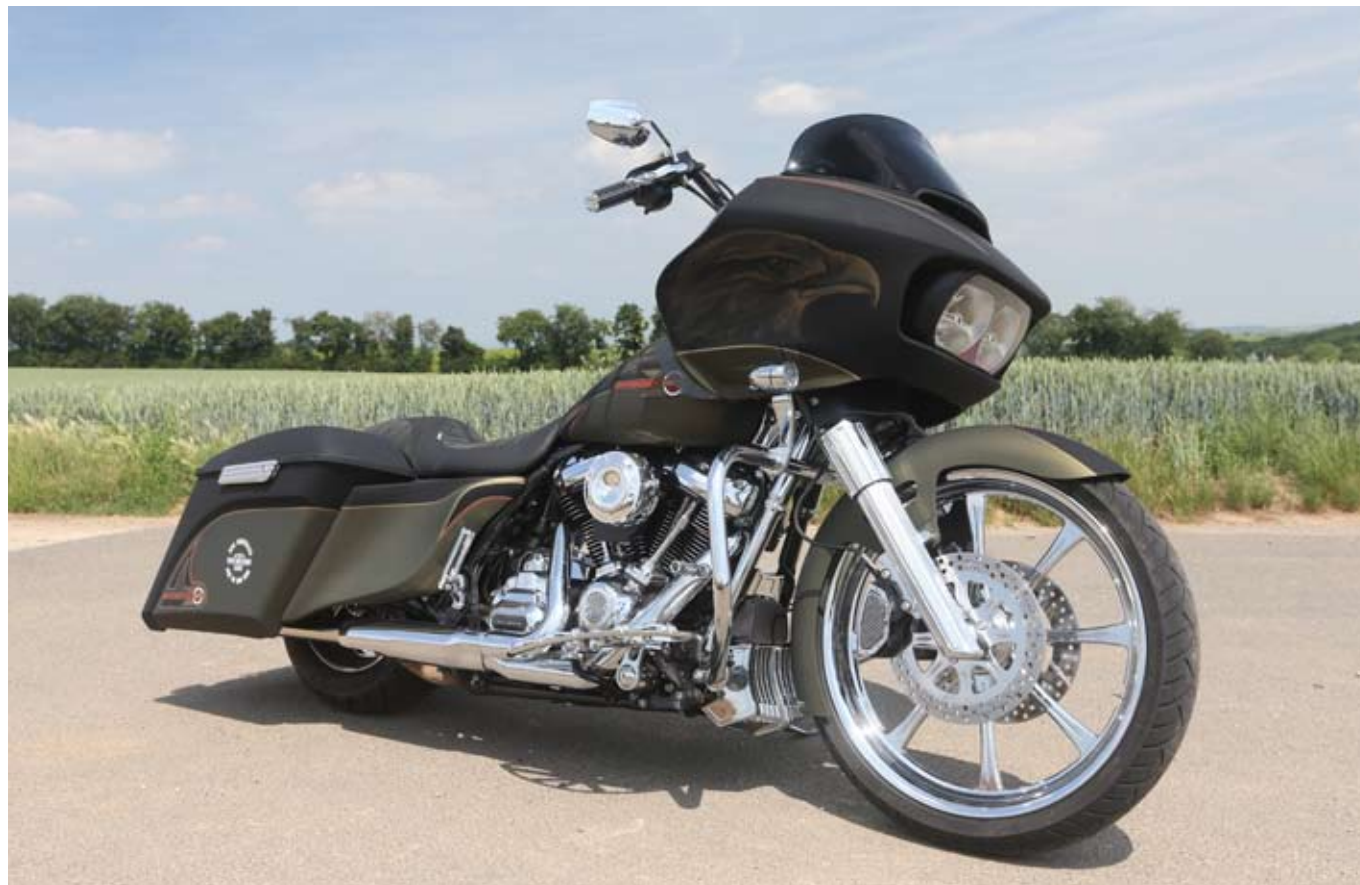
TOP: Harley-Davidson stock frame and motor, but change of wheel configuration and the size change in front make a difference on Harley-Davidson's top tourer. So do the Kuryakyn frame covers and steering head that add a lot of "bling" to the Road Glide.

nology" improve the riding performance of the heavy weight considerably. Despite Harley's successful efforts for weight reduction – and the lack of a top case on the rear end, the entertainment equipment and electronics hidden in the frame mounted front fairing are adding weight to the front end.