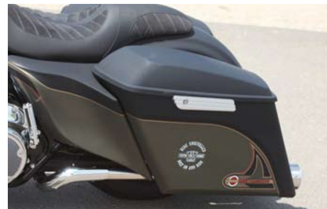
TOP: Arlen Ness stretched bags were available from the start of the M8 introduction of the touring models. Sidefillers are „Dirty Birds Concepts“.

„10 Gauge“ floorboards and foot brake cylinder cover completely the list of Arlen Ness parts used in this project.