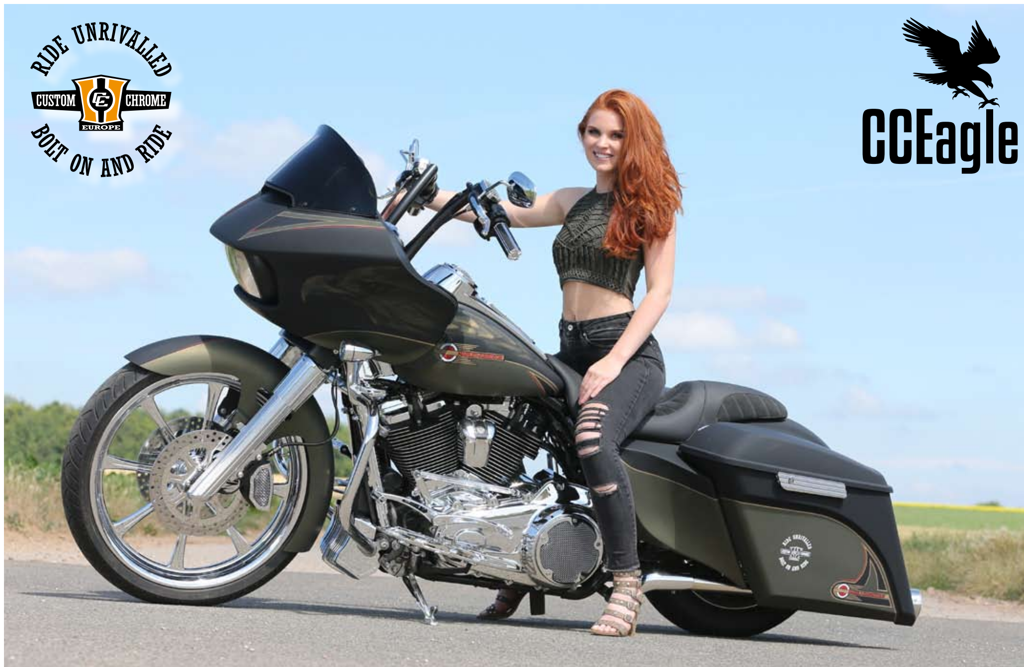
Low and Go! In "parked" position, the Road Glide demands respect – the seating position is lower than stock.