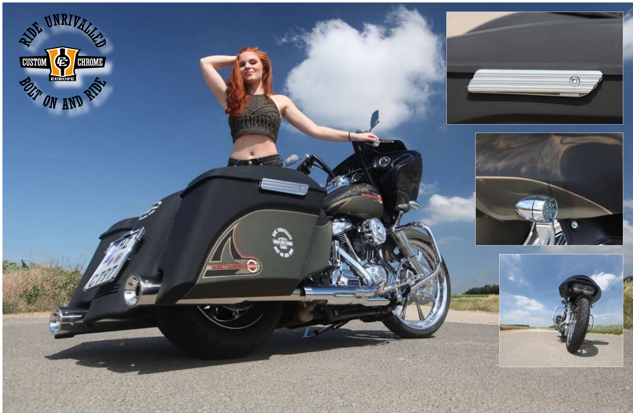
Yanina takes the handlebar: The Bagger conversion is suitable for most types of riders – if you are ready to control 400+ kg weight.